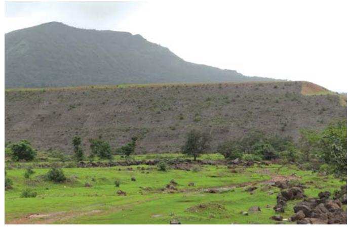
Incomplete Kal Kumbhe Hydropower Project, staled for more than two years due to lack of funds, Forest Clearance and rehabilitation issues.

The experts and stakeholders I talked with were unanimous in their opinion that Minor projects and groundwater have fared better in meeting irrigation needs of the farmers. They suggest a more nuanced understanding of irrigation needs of Konkan before launching big budget projects.