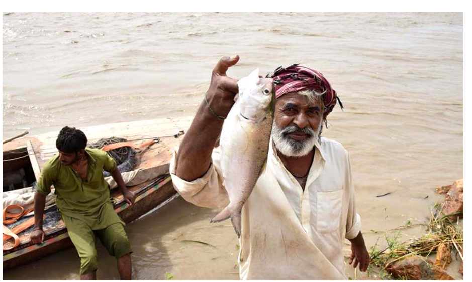
Mohana Fishermen of Indus with freshly caught Hilsa

flower, but he actually rides the Palla! It is said that in the Zindapir Shrine of Sukkur (A shared monument of Muslims and Hindus till very recently), Palla go to pay respect to its "Murshid" (Revered spiritual