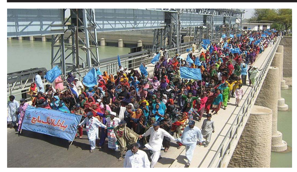
Fisherfolk Protest for more freshwater in Indus, Sindh

is at distance of 300 km from the sea. This obstruction has deprived Hilsa of two-thirds of the previous spawning area. Palla fish is severely depleted due to declines in the Indus water flow (majorly affected by the dam/barrage building) in the deltaic region."