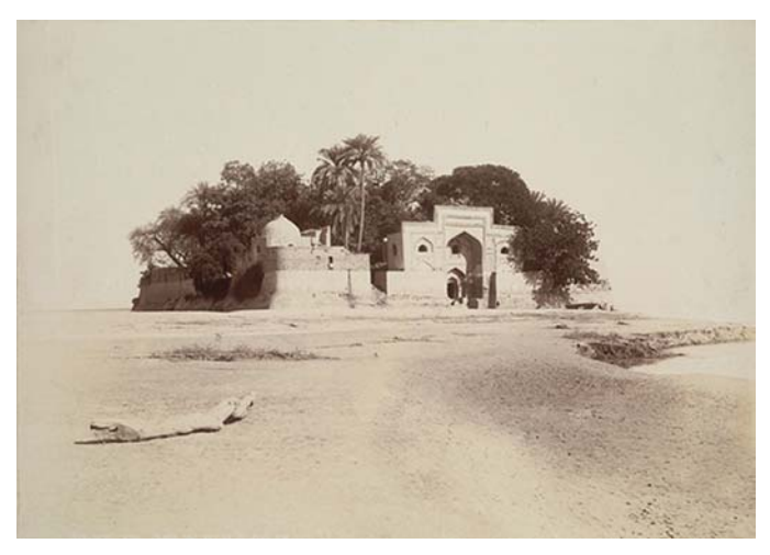
Zindapir Shrine at Sukkur