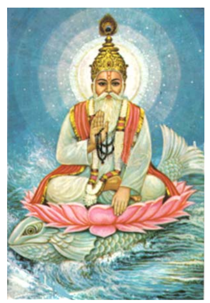
Jhulelal on Hilsa

An innocent riddle about a local fish, and I was about to find out that Jhulelal, that benign old man with a white flowing beard, has a lot to do with it.