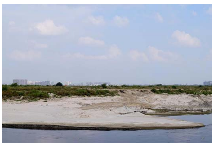
Mining ravaged river bed in NCR

National Capital Regions (NCR) Sand mining also happened on massive scale in Greater Noida, Noida (UP) and Faridabad, Palwal in Haryana (HR). In October 2015 the operators even built a bridge on River Yamuna as a link between Noida and Faridabad to facilitate sand mining. Reportedly it was the third bridge being built in the area to mine sand from the Noida floodplains and transport it to HR. In September 2015 on a brief visit to area SANDRP team found several patches of Yamuna riverbed ravaged by sand extraction carried out during nights. Villagers also reported that the operators were powerful and enjoyed full political support. Remarkably in July 2013 Durga Shakti Nagpal an Indian Administrative Service (IAS) official had conducted several raids on such operators. The officer was ultimately suspended and transferred. Barely three days after her transfer, 52 year old Pale Ram Chauhan, a vocal activist working against illegal mining was allegedly shot dead in Raipur village in Noida by the sand mafia. In another case, a 60 year old farmer Vijay Pal Nagar of Noida was attacked twice by the mafia for lodging complains against it. In the same year, a MoEF& CC team having visited the area, reported that illegal mining continued discretely in Greater Noida. The report also mentioned that the mafia had even created deep pools in riverbed and diverted Yamuna River for the smooth extraction of sand.